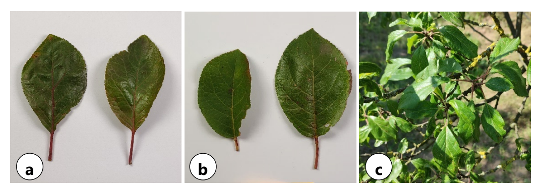
Figure 1. Leaves of polyploid interspecific hybrids with unknown origin. a) Hybrid 'M 61', b) Hybrid 'M 59', c) Hybrid 'M 57'.